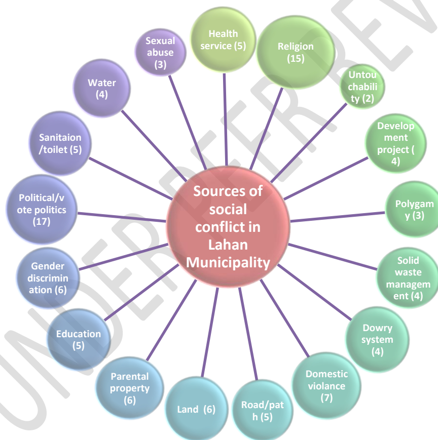
Fig 1:The source of social conflict in Lahan municipalitys

Political/vote politics and religion are the major source of social conflict in Lahan municipality while untouchability and polygamy are the minor sources of social conflict. (Fig. 1). :The source of social conflict in Lahan municipality has been shown below