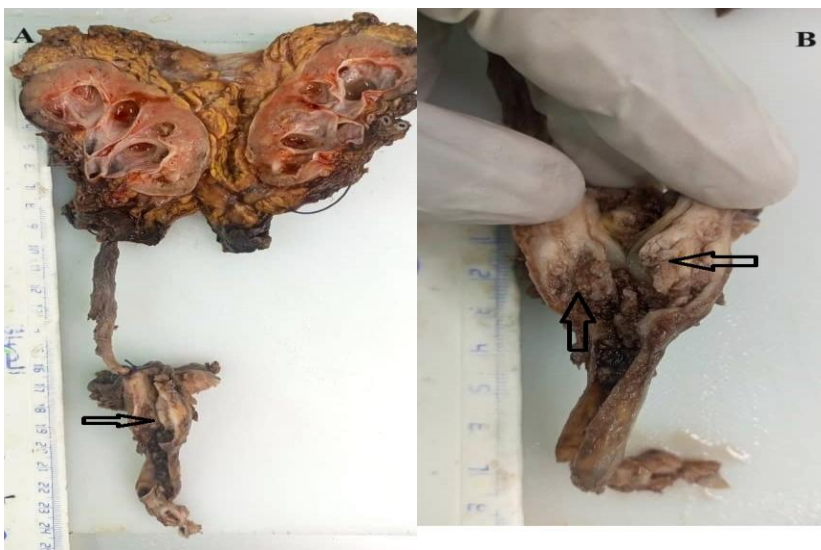
Figure 2: 2A: image of gross specimen showing cut surfaces of the left kidney and ureter. There is a tan friable mass in the distal one-third causing lumen (black arrow). 2B: image of gross specimen showing a closer view of the ureter with tan friable tumour (black arrows).

sections through the ureter showed a friable tan mass in the lumen causing near-complete occlusion with gross infiltration into the muscular wall (figure 2 A&B).