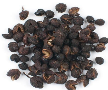
fig 6: Schezwan paper ( Zanthoxylum )

Nutritional value: Sichuan pepper, a popular culinary ingredient, is known for its unique anti-diabetic properties. A study conducted by Li et al. in 2020 provided crucial phytochemical data on Sichuan peppers. This data could potentially be utilized in the treatment and management of type-2 diabetes mellitus. The study highlights the potential of Sichuan pepper as a natural remedy in the fight against diabetes, opening up new avenues for further research and development in this field."