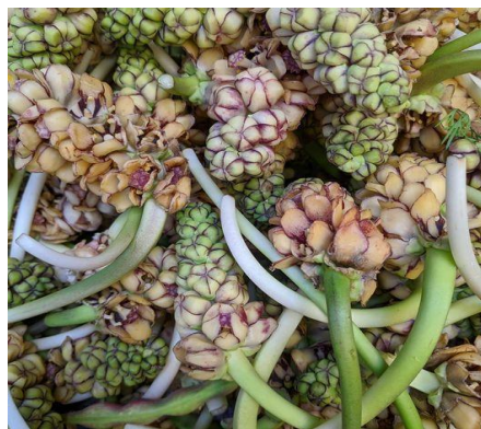
fig 5: Nakima ( Tupistra nutans )

metabolites. The root extract's \alpha -glucosidase inhibitory effect, antioxidant and antimicrobial activity, and phenolic compound estimated by Chung et al. (2019) validated its use in traditional medicine and suggested its potential as an important bioresource for the food and pharmaceutical industries. The plant's inflorescence has been reported to have anti-diabetic properties and fetch a higher price on the market, however, this is not entirely confirmed. A significantly elevated nutrient profile was found in this analysis, with 22.59% crude fat, 6.55 % crude fiber, 0.36 % total protein, and 0.43 % ascorbic acid. Magnesium, phosphorus, and potassium were found to be abundant when essential and nonessential minerals were analyzed. The ratio of potassium to sodium was high. One of the most effective plants to investigate for nutraceuticals is Tupistra nutans wall as studied by khaton et al. (2018).