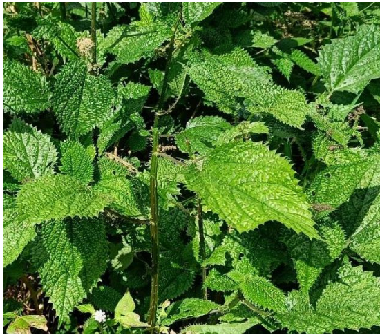
Fig 4: Stinging Nettle ( Urtica dioica )

Nutritional value: Enlightened about the various attributes of nettle that are utilized to manage arthritis, rheumatism and allergic rhinitis. Its foliage is rich in fiber, minerals, vitamins, and antioxidant substances such as polyphenols and carotenoids. Stinging nettle possesses antiproliferative, anti-inflammatory, antioxidant, analgesic, anti-infectious, hypotensive and antiulcer properties, along with the capacity to avert cardiovascular diseases. (Bhusal et al.2022)