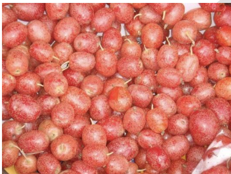
Fig 7: Mullero/musledi ( Elaeagnus latifolia )

Nutrient content: The fruits of Elaeagnus conferta (muslendi) are rich in essential minerals, vitamins such as vitamin C, A, and E, as well as flavonoids and phenol compounds (De, 2017). Many studies has done on nutritional value of its fruits which suggests that it contains high nutritive value, such as Rai et al. (2005) found that the fruits of Elaeagnus conferta contains 91.7 \pm 2.0 % moisture, 0.7 \pm 0.1 % ash, 0.8 \pm 0.2 % fat, 1.4 \pm 0.5 % protein, 5.3 \pm 0.5 % carbohydrate, 6.7 \pm 0.3 mg/100 g sodium, 233.5 \pm 2.3 mg/100 g calcium and 5.8 \pm 0.3 mg/100 g of potassium with a high nutritive value of 34.0 \pm 2.5 Kcal/100 g.