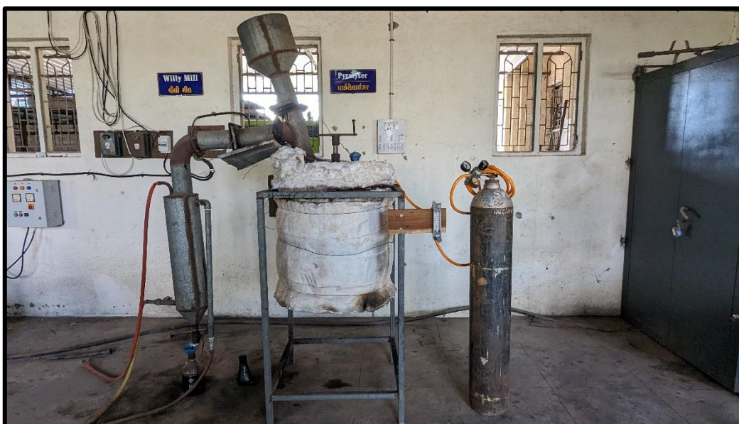
Fig. 1 Experimental batch type pyrolyser

The pyrolyzing unit consists of a stainless-steel reactor activation chamber (4-5 mm thickness) with outer surface insulation to minimize heat loss due to radiation. The reactor is mounted on a stand for structural stability. An opening at the bottom allows removal of activated biochar. A manual stirrer, attached to the top, ensures periodic agitation (1-2 gentle rotations every 10-15 minutes) of reactants inside the chamber. Makavana et al. (2020).