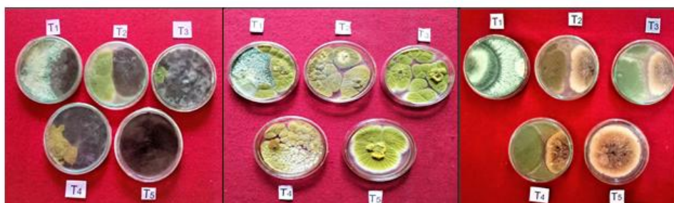
Fig 3: Inhibition of A. niger , A. flavus and F.oxysporum f. sp. cepae by different biocontrol agents

growth of 38.00 mm and 42.00 mm, and inhibition of 57.30% and 52.53%, respectively. T. harzianum , on the other hand, was found to be the least effective, with the maximum linear mycelial growth (42.25 mm) and the lowest mycelial growth inhibition (52.81%) (Figure 3). T. viride was reported to be most efficient against F. oxysporum f. sp. cepae by El-mougy and Abdel-Kader (2019); Jagtap and Suryawanshi (2015) and decreased radial mycelial development by 78.88%.