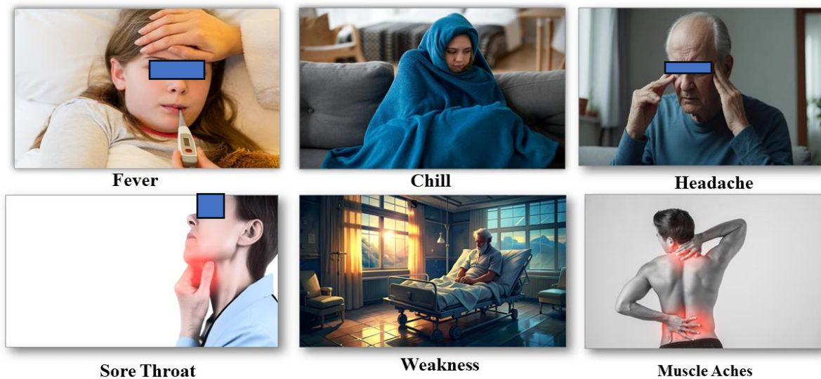
Fig:2 Signs and Symptoms of Viral Hemorrhagic Fever.