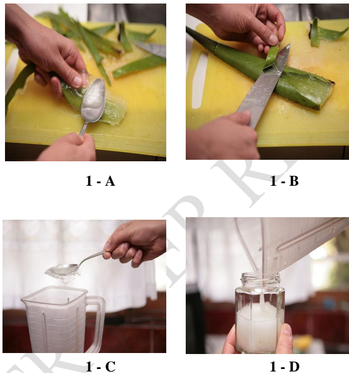
Figure 1 : Preparation Assay of Aloe Vera in Fresh Gel Form

stable. Because many of the active ingredients in the gel appear to deteriorate on storage, the use of fresh gel is recommended. Preparation of fresh gel: harvest leaves and wash them with water and a mild chlorine solution. Remove the outer layers of the leaf including the pericyclic cells (Figure 1- A), leaving a "fillet" of gel. Peel the gel and scoop out gel with a spoon (Figure 1- B). Place into a blender (Figure 1- C). Place in a sterilized, clean glass jar, will keep for several months in the refrigerator (Figure 1- D). Care should be taken not to tear the green rind which can contaminate the fillet with leaf exudate. Aloe vera gel could be kept in the refrigerator to keep it fresh for about 3 months [9] .