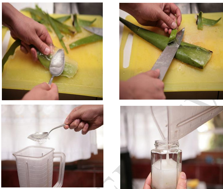
Figure 1 : Aloe Vera in Fresh

(Figure 1- D). Care should be taken not to tear the green rind which can contaminate the fillet with leaf exudate. Aloe vera gel could be kept in the refrigerator to keep it fresh for about 3 months [9] .