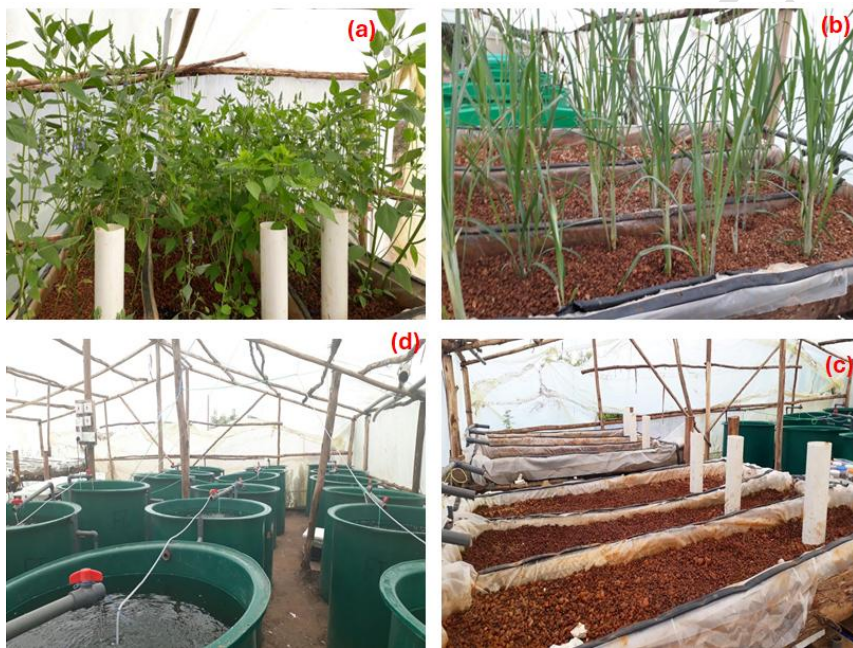
Plate 1. Experimental set up of the aquaponic system with the three different treatments (a) S. hispanica (b) C. citratus , (c) Control without plants and (d) recirculating aquaculture system