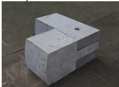
Fig. 2 Recycled concrete