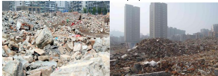
Fig. 1 Waste Concrete

With the increase of urban population and functional demand, more and more cities are starting to build various types of high-rise and super high-rise buildings. Due to the continuous expansion of town building scale, as shown in Figure 1, the problem of excessive consumption of resources and construction waste has become increasingly serious. In order to achieve sustainable development of the construction industry, the application of recycled coarse aggregate concrete based on the secondary utilization of waste concrete has emerged. At present, a large amount of research on the compressive performance of recycled coarse aggregate concrete has been carried out both domestically and internationally. The general results indicate that the mechanical properties of recycled coarse aggregate concrete have decreased [1] , which to some extent limits the application of recycled concrete in practical engineering. If recycled concrete is added to steel pipes to form recycled steel pipe concrete, it can improve the mechanical properties of concrete.