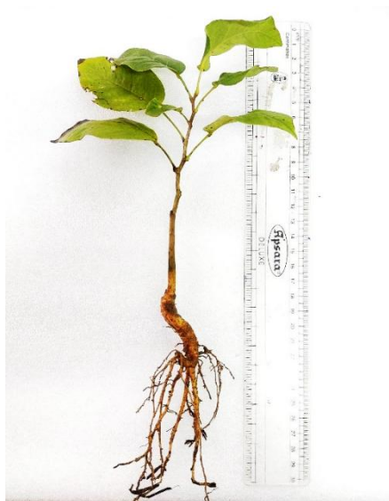
Fig. 3. Estimation of shoot and root length of sample P. marsupium seedling

OPSTAT for further statistical analysis. Factorial Multivariate Analysis of Variance (MANOVA) with Duncan's Multiple Range Test (DMRT) was carried out in IBM SPSS 25.0 for finding the best treatment, accession, and their interaction with statistical significance.