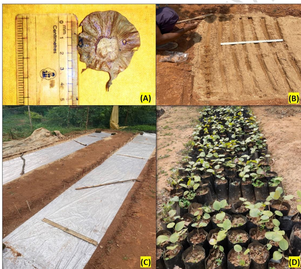
Fig. 2. Standard nursery techniques followed during the study. (A) Quality seed of P. marsupium graded for the study; (B) Line sowing of seeds according to the design of experiment; (C) Sand bed with plastic mulching after sowing; (D) Shifting of seedlings to polybags after noting down all observations (after 56 DAS)