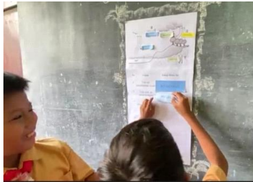
134 135 Figure 1. Playing Card Group