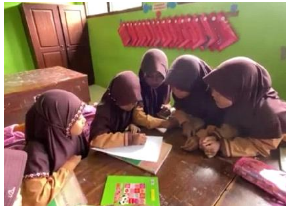
139 140 141 Figure 3. Drawing Group