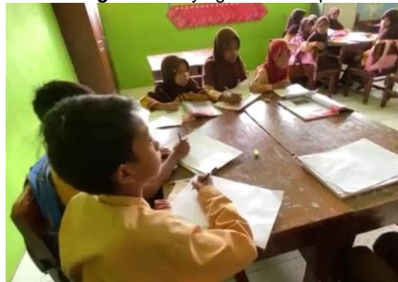
136 137 138 Figure 2. Group Singing