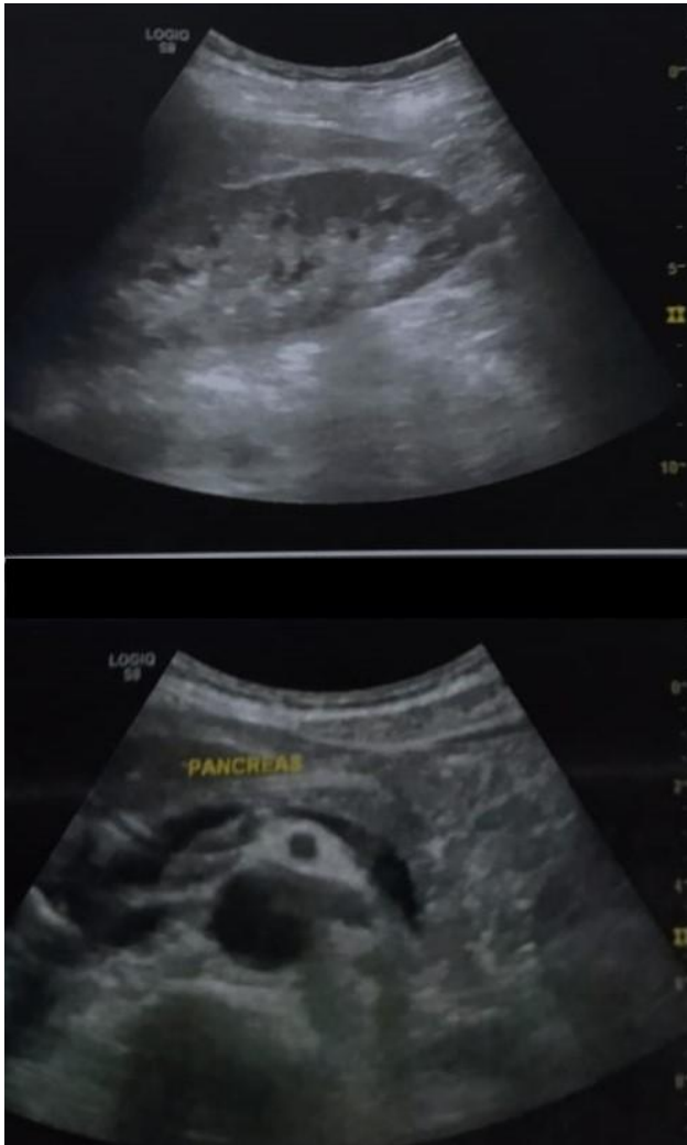
Fig. 1 Abdominal ultrasound images showing...

Complementary scanning showed a non-distended, multilithiasic gallbladder with dilation of the main bile duct and signs of cholangitis. Coeliomesenteric and right iliac lymph nodes and adenomegalies, some necrotic, were observed.