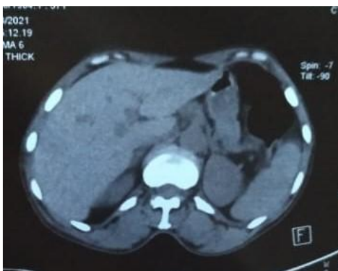
Fig. 2 CT scan images of the liver...

Complementary scanning showed a non-distended, multilithiasic gallbladder with dilation of the main bile duct and signs of cholangitis. Coeliomesenteric and right iliac lymph nodes and adenomegalies, some necrotic, were observed.