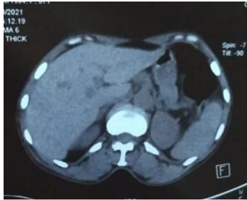
Fig. 2 CT scan images of the liver...

Biological analyses showed a positive serology for echinococcosis.