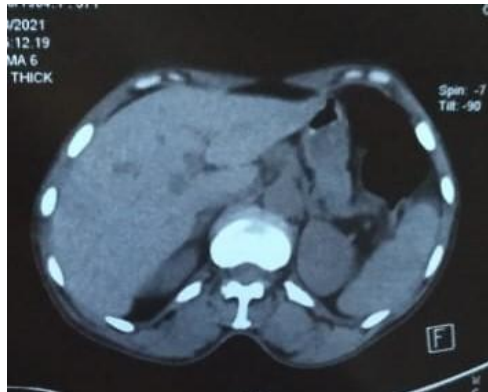
Fig. 2 CT scan images

Biological analyses showed a positive serology for echinococcosis. Subsequent subcostal surgery revealed a markedly thickened gallbladder wall with calculi, displaced by a hydatid cyst from segment V, exerting pressure on the main bile duct. Notably, no other hepatic lesions were identified, and there was no significant effusion.