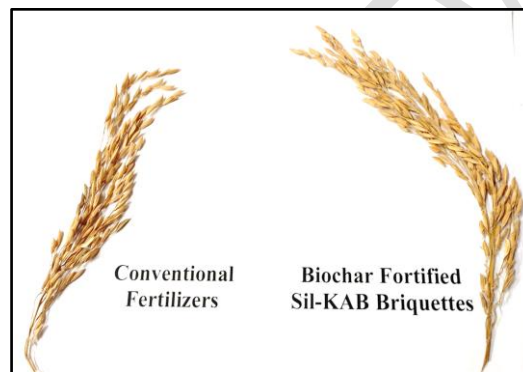
Fig. 2:Panicle length

The mean comparison at a 5 per cent significance level on panicle length between the two treatments is presented in Table 2. According to the results, the plots where biochar fortified Sil-KAB briquette was applied recorded a significantly higher panicle length (20.83 cm) compared to the plots receiving fertilizers through conventional methods (18.33 cm). It is assumed that nitrogen, being an essential constituent of amino acids, nucleic acids, nucleotides, and chlorophyll, plays a crucial role in cell division and tissue differentiation. This, in turn, contributes to the development of new cells, tissues, and plant organs. Yoshida (1987) suggested that the increased panicle length observed may be attributed to enhanced cell division and tissue differentiation during the flowering stage.