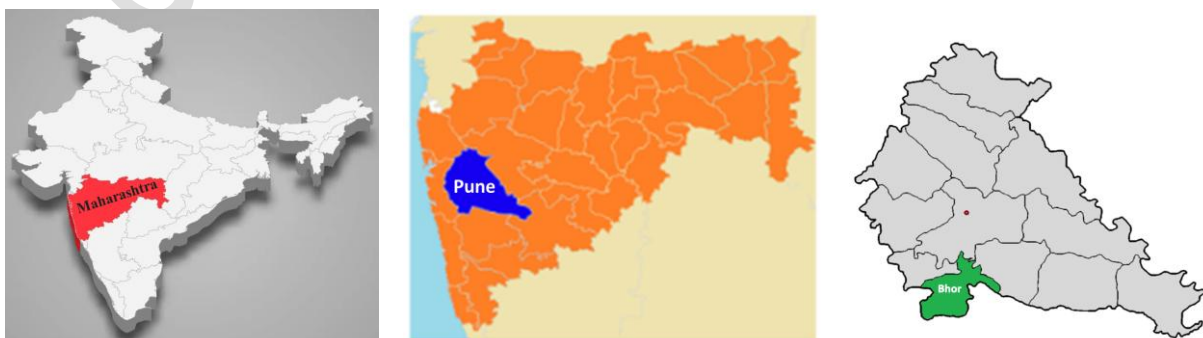
Fig. 1: Location map of study area

The target sites for the study were the Bhor blocks of Pune district (Maharashtra, India). The study site in Bhor block lies at latitudes 18^{\circ} 9'38.23''\text{N} to 18^{\circ}10'22.90''\text{N} and longitudes 73^{\circ}46'30.04''\text{E} to 73^{\circ}49'35.30''\text{E} . The major rivers flowing in the Bhor block are Nira, Velvandi and Gunjavani, which flow from west to east, and Shivaganga from north to south. The two largest dams in the block are Bhatghar on the Velvandi river and Nira Devghar on the Nira. The average annual rainfall in the Bhor block is 900 mm. Most of the Bhor block is covered by Deccan basalt, and thick alluvial soil spreads along the banks of the Nira and Velvandi rivers. The region is also of historical importance as it was the main link between the Deccan Plateau and the west coast. The soil is deep, with moderately well-drained clay soils. The main crops grown in the Bhor block are paddy, sorghum and ragi. Minor crops include groundnut, pigeon pea and sugarcane (Awasarkaret et al. , 2014).