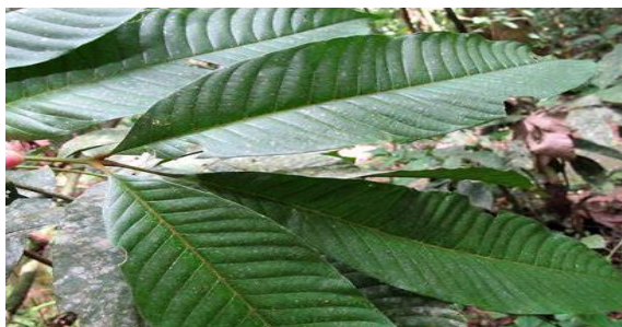
Fig 1: The leaf of Trichilia heudelotii.

Comment [A3]: Better to use updated references if applicable