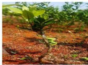
1b. Plant Height