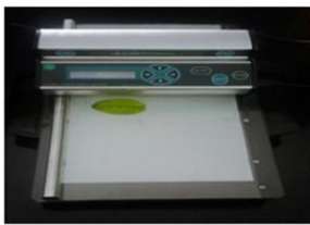
1a. Leaf area meter