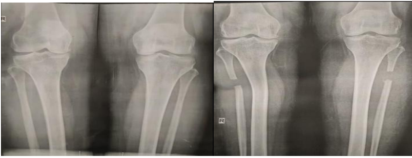
Figure 1: Preoperative and one-year postoperative standing X-ray of both knees (AP and lateral views) shows medial compartment knee osteoarthritis type 2 and also shows good improvement in the radiological assessment of the medial joint space of both knees.