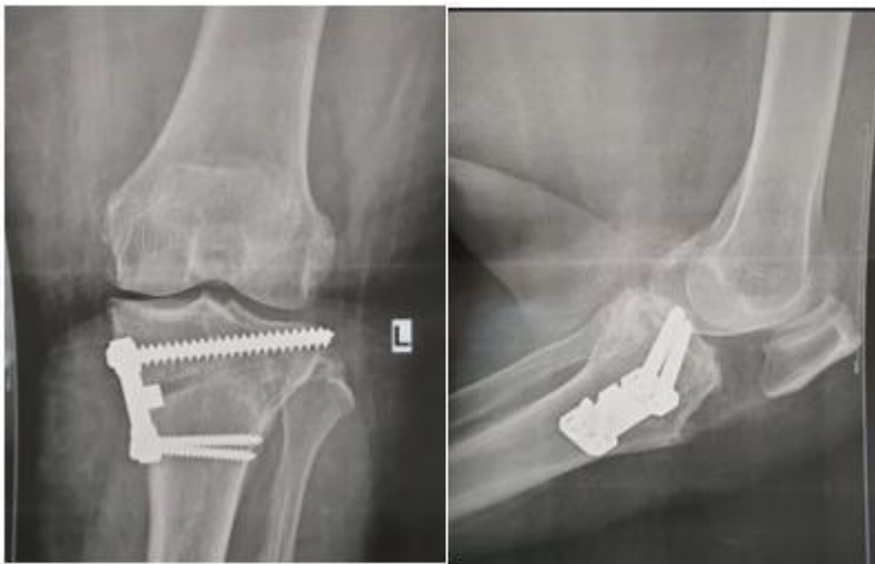
Figure 2: One-year follow-up post-operative standing X-ray of both knees AP and lateral views by high tibial osteotomy.