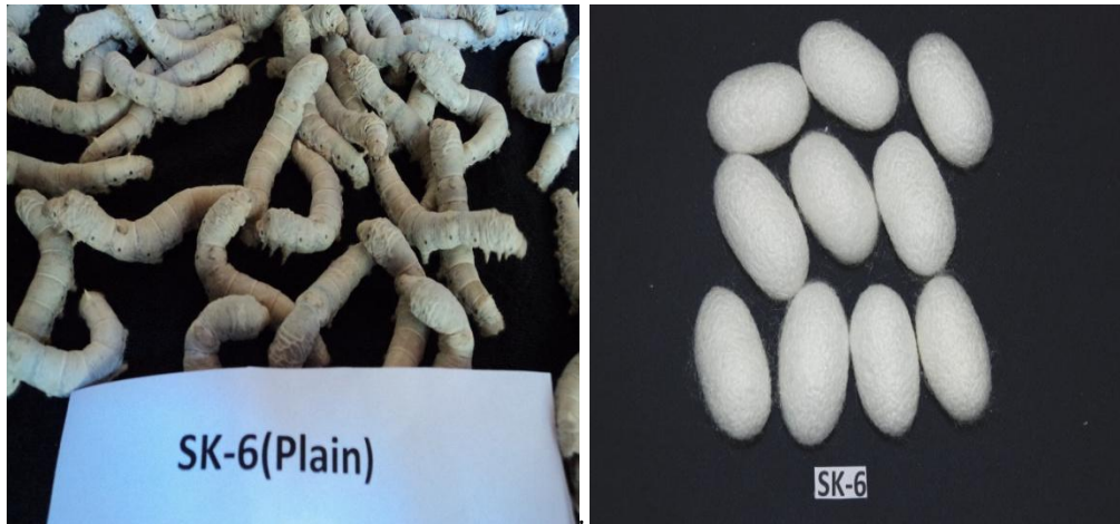
(Fig i: Source of Fibroin Protein)

a hydrophobic glycoprotein. (Gamo, et al., 1977) In general, fibroin nanoparticle biochemistry entails processing and modifying silk fibroin to produce nanoparticles with desired characteristics and investigating how these nanoparticles interact with biological systems for a range of biomedical applications. (Wang & Zhang, 2015).