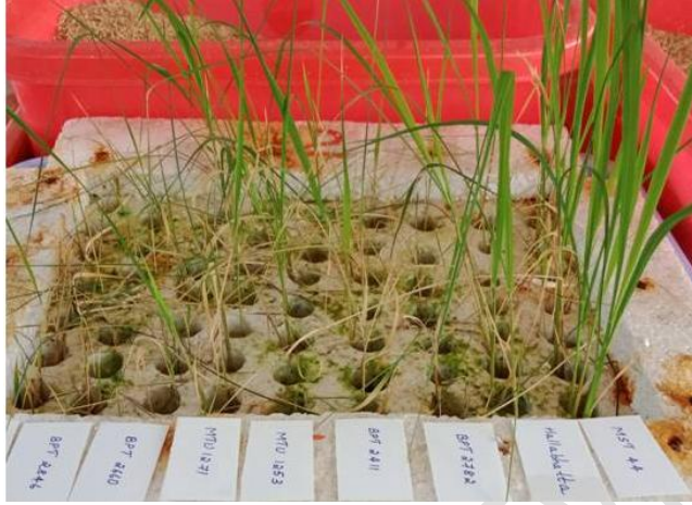
Plate iv. Scoring at 16 th day after salinization