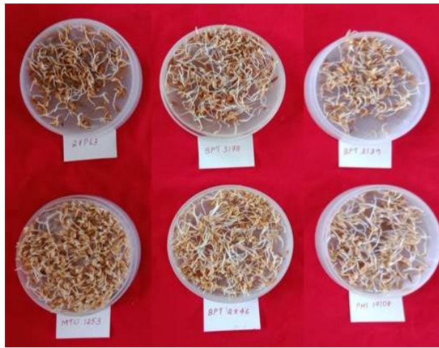
Plate i. Seeds kept in petriplates for germination