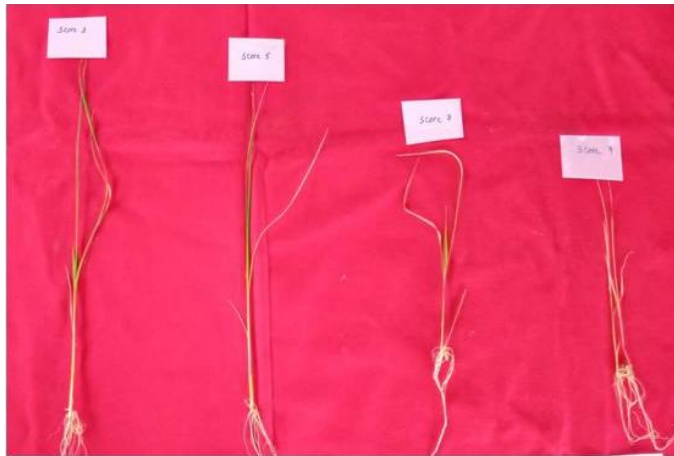
FL 478 MST 47 MTU 1121 Krishnahamsa Score 3 Score 5 Score 7 Score 9