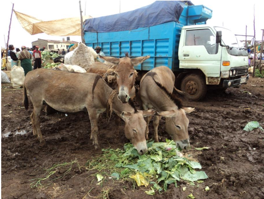
Figure 1: Donkeys feeding on vegetable trimmings after delivering farm produce to the market

working environment. As such, specific management practices need to be devised in order to fully maximize their work output. Some challenges affecting their health include diseases such as African Horse Sickness 9 , Toxoplasmosis 10 , Parasitic infections 11 , Wounds 12 , Trypanosomiasis 13 , dental problems 14 . inadequate or inappropriate nutrition 3 also shown in Figure 1, feed shortages 15,16 , inability of donkey owners and users to recognize, and manage basic welfare issues (such as pain or behavioral problems), lameness, chronic or endemic health issues 3 , overloading, overworking 14,16 , inhumane handling 17 , inappropriate harnessing 14,16 and working in poor roads 15 among others.