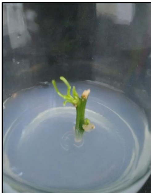
Figure. 1: Shoot formation in BAP 1.0 mgL -1