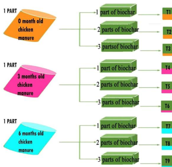
FigurePicture1 :1: The diagram below shows the vVarious treatments for the experiment:

The design used for the laboratory work was 3*3 factorial in Completely Randomised Design (CRD) and it was replicated three times. The factors were: the decomposition stages of chicken manure and the different rates of biochar as shown in the figure below .