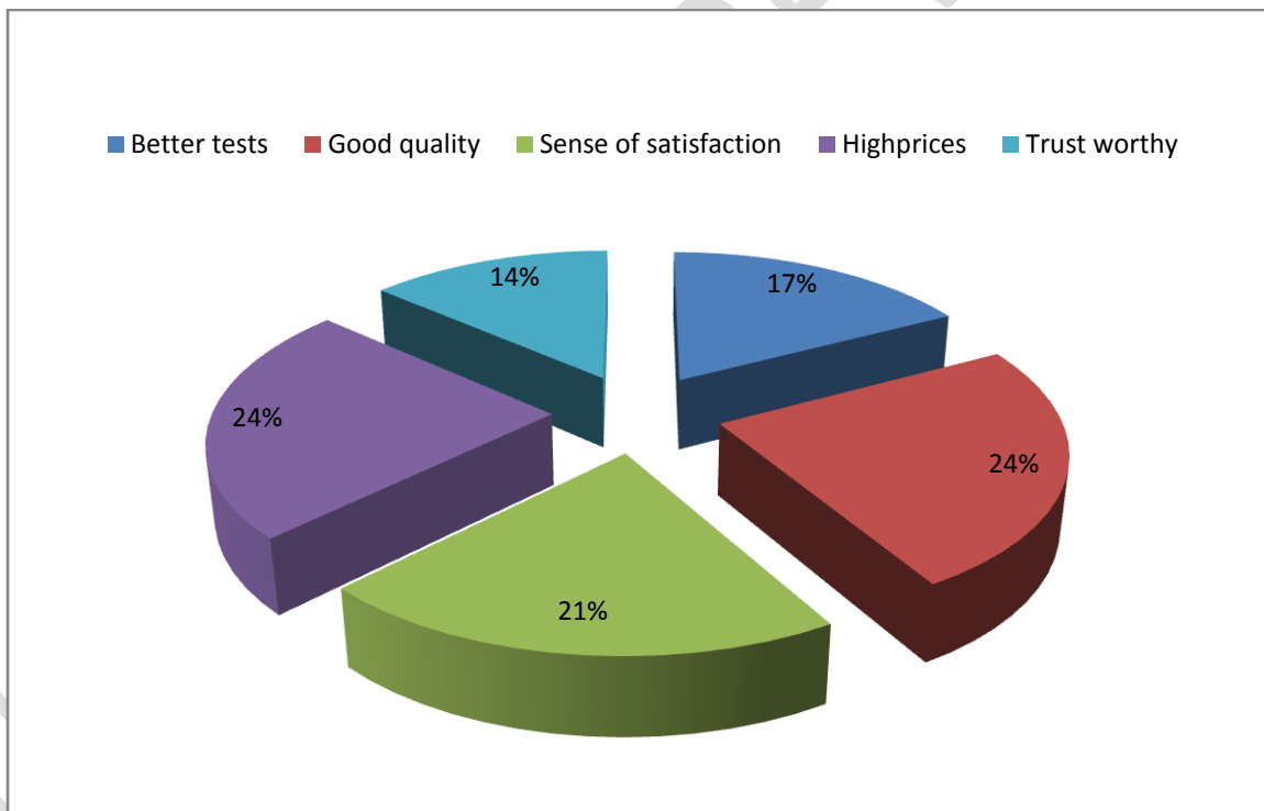
Fig No. 1 Distribution of respondents according to the opinion of price and quality

This table shows that the opinion of the respondents brand and label of organic food products during Covid-19, 76.7% respondents were agree with the are you notice the government marks and label of food products with mean score 2.65, standard deviation 2.2 and rank I followed by 44.2% respondents were agree with are you buying organic food products only because of brand