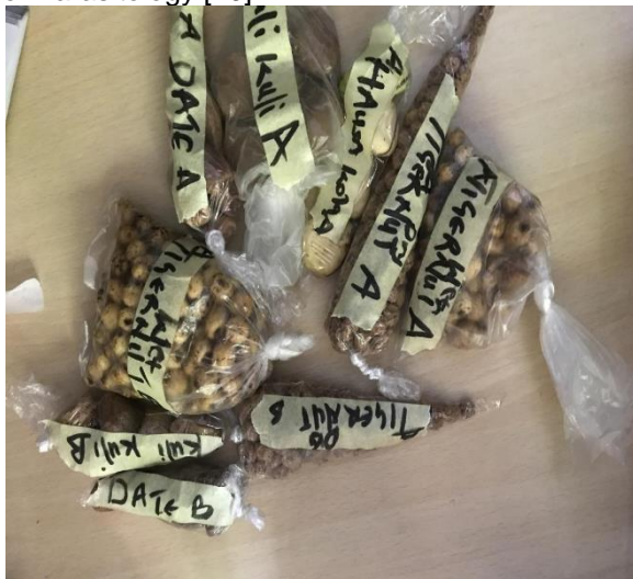
Plate 1. Samples to be examined

Using a plastic pipette, normal saline was placed at one end of a clean grease-free glass slide and iodine was placed on the other end and a drop of the sample Aliquot was emulsified at both ends and were covered with cover slips carefully to avoid air bubbles. The smear was examined using a low power (10x) objective and then again by using a high power (40x) objective lenses respectively. The eggs/ova, cyst and larvae of parasites were identified with reference to Atlas of Parasitology [10].