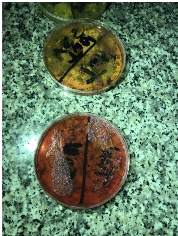
Plate 2. Macconkey and Salmonella Shigella Agar cultured plates after 24 hours incubation.