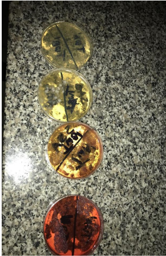
Plate 3. Macconkey, Salmonella Shigella , Sabouraud Dextrose and Nutrient Agar cultured plates after 24 hours incubation