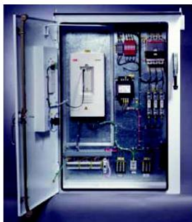
Figure 5. ABB ALC 600 controller

The controllers work in conjunction with frequency converters. Due to the absence of external sensors, the cost of the automation system is reduced, reliability is increased, and installation time is reduced. Another advantage of this approach is the versatility of application: the same controller can control both SHGN and screw and electric pumping units. However, it should be noted that the dynamogram obtained in this way will be very approximate, which will negatively affect the quality of control and diagnostic results.