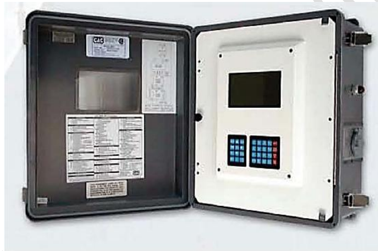
Figure 2. The CAC8800 controller from eProduction Solutions

eProduction Solutions Company It offers a number of controllers for installation on SHGN wells at once. These are the CAC2000, CAC8800, ePIC, ePAC and iBEAM controllers. The functionality of the first three controllers is similar to Lufkin's SAM Well Manager. It provides for the connection of passive force sensors located on the rod (Loadtrol type sensor) or on the balancer, as well as sensors for the movement parameters of the rod of several types: Hall sensors located on the crank shaft, sensors for the angle of inclination of the balancer and potentiometric angle sensors. The measurement of signals from analog sensors is performed by a 12-bit ADC with a frequency of 20 Hz. It is possible to calibrate the sensors directly at the well. There is a keyboard and a graphical display for viewing data (Figure 2). The degree of balance of the counterweights of the pumping unit is determined. Unlike previous products, ePAC is a complete system of adjustable electric drive for a pumping unit. It allows you to vary the pump swing speed within wide limits, as well as separately optimize the stroke time of the plunger up and down