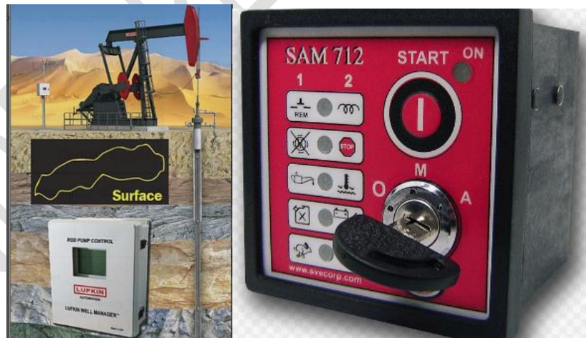
Figure 1. The SAM Well Manager controller (SEM 212) from Lufkin

The SAM Well Manager controller uses the generated dynamogram to determine the degree of filling of the borehole with liquid. If the analysis shows that the well has been emptied, the pump is turned off and the well is put into accumulation mode. In this mode, it is filled with liquid again, after which the control unit turns on the pump motor and begins pumping.