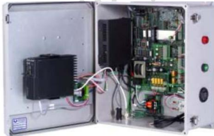
Figure 4. Automation Electronics AEPOC 2100 controller

The AEPOC 2100 controller from Automation Electronics differs from the others in the high resolution of the ADC (Figure 4).