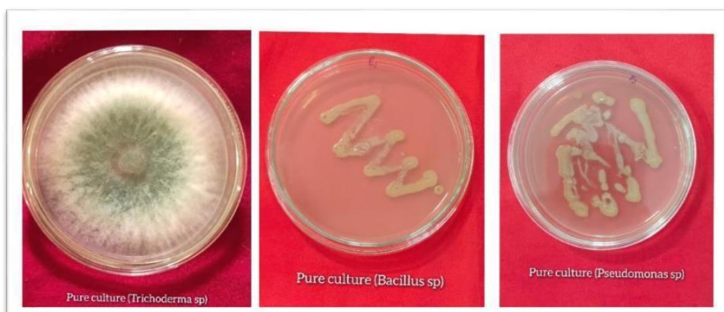
Plate .1 Pure culture of bio-agents

Serial dilutions and spread plate techniques were adopted on the talc formulations to obtain the pure cultures of the bio-agents. For T. viride , PDA was used as medium and incubated at 25 0 C for 3 days while Pseudomonas fluorescens and Bacillus thuringiensis is KB and NA were used respectively at 37 0 C for 48 hours.