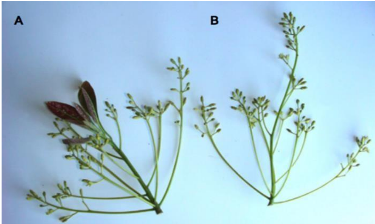
Fig2.A. Indeterminate inflorescences; B. Determined inflorescences in P. americanacv. Hass.

display an indeterminate characteristic, eventually giving rise to leafy buds. Typically, these clusters are located on the exterior of the tree, receiving the most sunlight. In a pruning programme, a challenge arises when it comes to hedgerow pruning or shaping later in the season. During this process, a significant number of shoots that are on the verge of forming panicles and flowers end up being removed (Bergh, 1986).