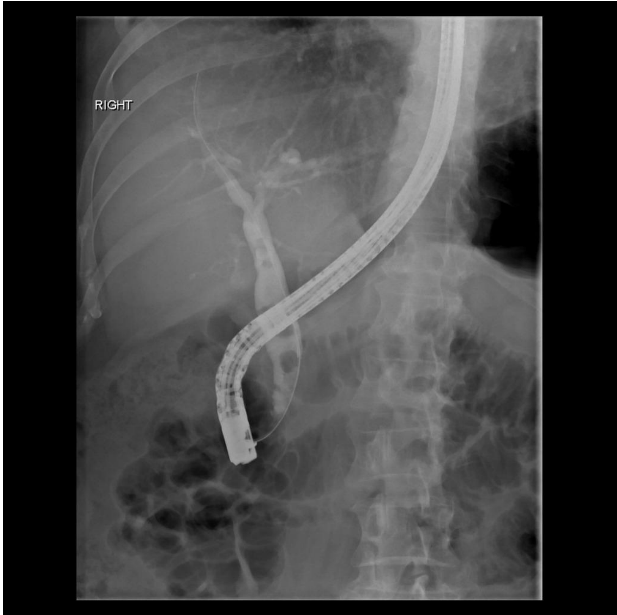
Image of endoscopic retrograde cholangiopancreatography (ERCP) with bile duct stones

Laparoscopic common bile duct exploration and cholecystectomy