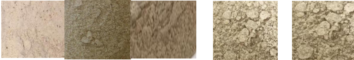
F1 (sorghum + bean) F2 (maize + peanut) F3 (sorghum + soy)

The biological material consists of 5 different infant flours produced by the ONG Tasnim at a rate of 3 samples of 100g per formulation. These flours have been formulated with millet ( Pennisetum glaucum ), sorghum ( Sorghum bicolor ), maize ( Zea mays ), soy ( Glycine max ), beans ( Phaseolus vulgaris ) and peanuts ( Arachis hypogaea ).