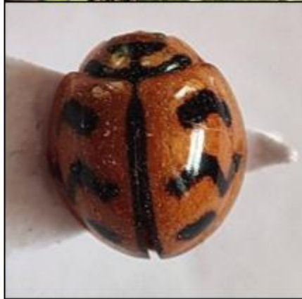
Plate 2. Natural enemies recorded during studies on succession and population dynamics