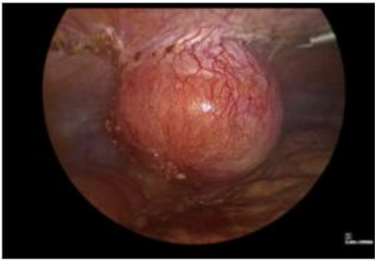
Figure 2 – Cystic swelling arising from anterior abdominal wall.