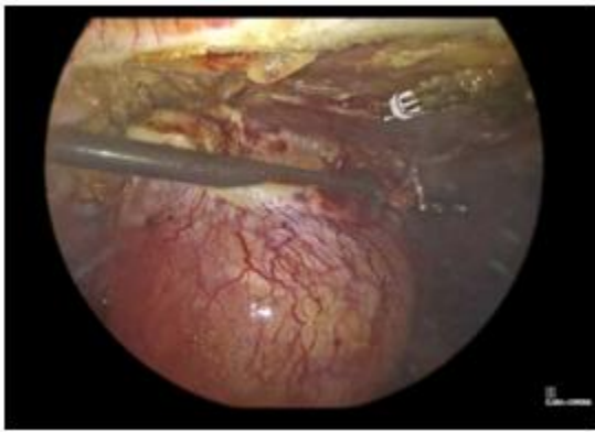
Figure 3 – Cyst is free from the rectus muscle and origin from preperitoneal space.