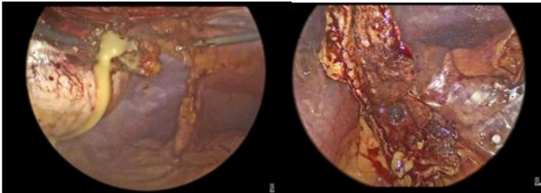
Figure 4 - containing pus and retained gall stone.