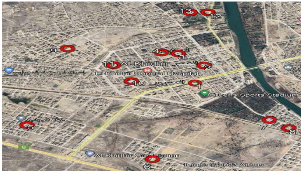
Figure (2): The locations of the studied schools.

Where ( C_{Rn} ) is the radon concentration (Bq/m 3 ), (K) is the calibration factor of LR-115 Type II detector, which is equal to (0.0344 ± 0.002) (track cm -2 /Bq m -3 .day)[14], ( \rho ) is the track density (average track count per cm 2 ), (T) is the exposure time (day).