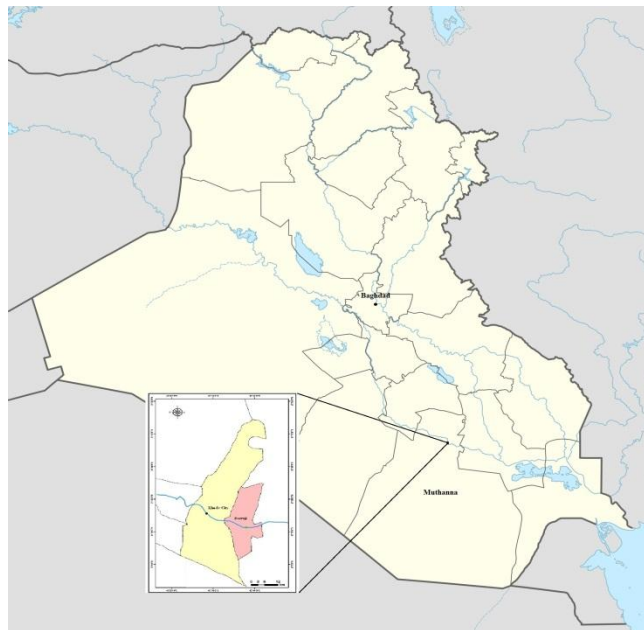
Figure (1): The location of the study area.

The current study aimed to estimate indoor radon levels in selected primary schools in Khidir City, Muthanna Province, Iraq. Khidir City is located in the south of Muthanna Province, 30 km south of Samawa City, the capital of the province, see Fig. 1. The number of investigated schools was 13 primary schools on the west side of the city, on the western bank of the Euphrates, schools were spread across different soils, including agricultural, sandy, and saline. On the other hand, the schools differed in terms of building materials and the age of the buildings.