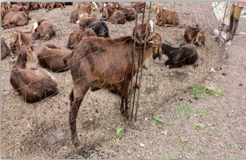
Figure 4: Sheep in open fence