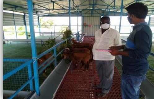
Figure 3: Galvanized roofing with slatted flooring