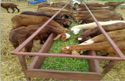
Figure 2: Sheep feeding in manger