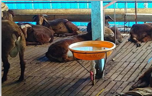
Figure 6: Trough water for sheep in shed