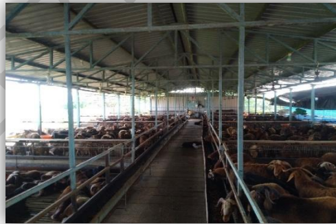
Figure 5: Sheep in closed shed