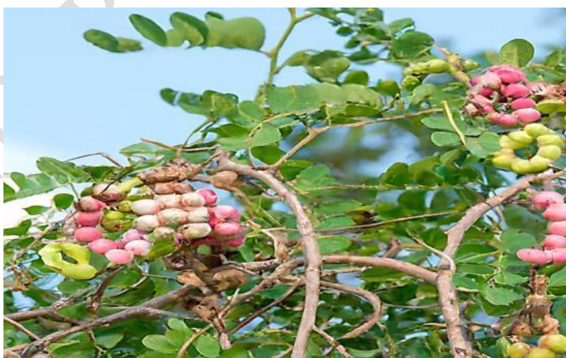
Figure 1. Pithecellobium dulce (Jungle jalebi) Plant.

The chemical compounds present in plants are used as antidiabetics, anticancer, antiinflammation etc. There are several allopathic medicines used in the treatment of diseases but they also have several side effects and drug interactions, so there is a need for herbal treatments that have lesser or no side effect. Here, the review discusses the protection against various diseases and their pharmacological properties of the P. dulce (5,6).