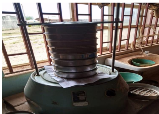
Figure 4: Mechanical Sieve Shaker

Some quantity of stones of different sizes were taken from the field for size determination, using a mechanical sieve as shown in Figure4. The stone size of 2.36mm weighing 200 g was chosen and mixed with the igbemo rice of 6kg making a total of 6.2kg. The mixture of the rice and stones were thoroughly mixed together. 200g of the mixed rice with stone was measured and it was handpicked to separate the rice, chaff, defective and stone. This was used to serve as the control for the efficiency of the machine.