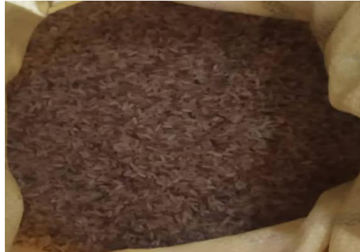
Figure1: Rice Sample

Locally produced rice ( Oryza sativa ) as shown in Figure 1 was obtained from Igbemo market to evaluate the performance of the mechanical rice de-stoner