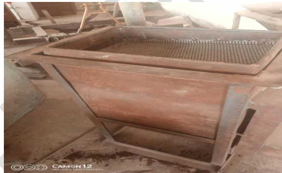
Figure2: The Existing Mechanical Rice de-stoner

The existing rice de-stoner as shown in Figure 2 needed to be modified in the department of Agricultural & Bio-Environmental Engineering workshop.