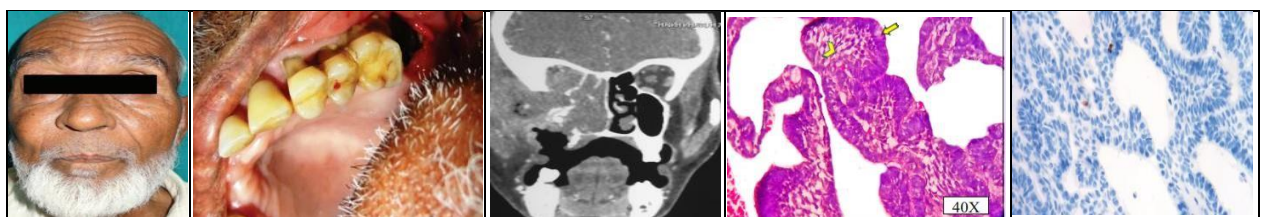
Fig 3. (a) Extraoral photograph (b) Intraoral photograph showing swelling left upper buccal vestibular region with 25,26 (c) Computed tomogram (coronal view) shows a well-defined osteolytic lesion (d) H & E (40x) (e) Calretinin negative.

In this case, a provisional diagnosis of basal cell adenoma mimicking ameloblastoma was made, with a differential diagnosis of basal cell adenocarcinoma. Immunostaining for calretinin helped rule out ameloblastoma.