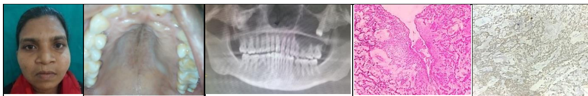
Fig 1. (a) Extraoral photograph- shows swelling (b) Intraoral photograph- showing swelling left palatal region (c) Panoramic radiograph shows well-defined corticated expansile lesion with impacted teeth (d) H & E (10x) (e) Calretinin positive.

In this case on incisional biopsy, the initial diagnosis suggested an infected dental cyst. Notably ,a few odontogenic islands exhibited reverse polarity & hyperchromatic nuclei characteristic of ameloblastomatous epithelium, however with calretinin upon further examination the biopsy results indicated features consistent with ameloblastoma.