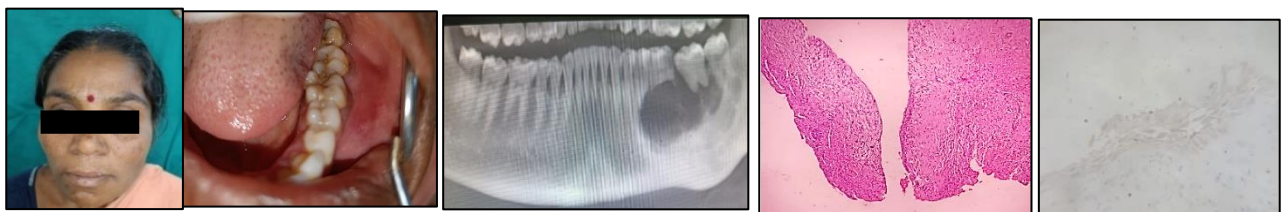
Fig 2. (a) Extraoral photograph shows swelling on left lower jaw (b) Intraoral photograph showing swelling on left lower vestibular region with 35,36 (c) Panoramic radiograph shows well-defined corticated expansile lesion with root resorption 34,35,36(d) H & E (10x) (e) Calretinin positive.

Positive Immunostaining of calretinin suggestive provisional diagnosis as ameloblastoma.