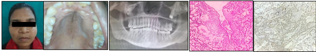
Fig 1. (a) Extraoral photograph- shows swelling (b) Intraoral photograph showing swelling left palatal region (c) Panoramic radiograph shows well-defined corticated expansile lesion with impacted teeth (d) H & E (10x) (e) Calretinin positive.