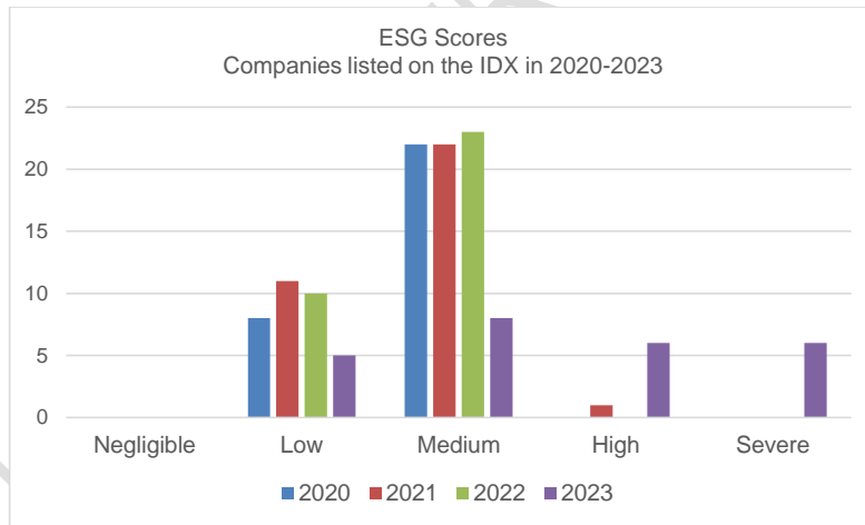
Chart 1. Number of ESG Scores Companies listed on the IDX in 2020-2023 Source: Morningstar Sustainalytics 2020-2023