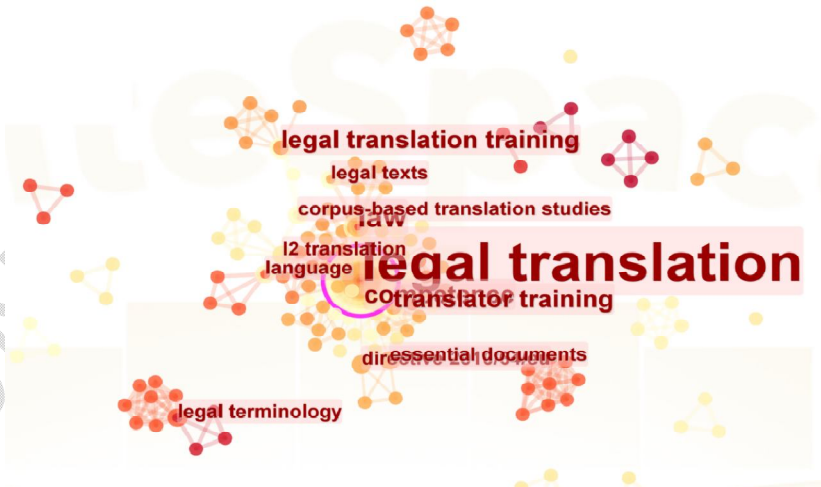
Figure 2. Research hotspot map in the West

This study uses the Keyword in CiteSpace to evaluate the co-occurring keywords in international research hotspots in order to shed light on the legal translation research hotspot. As shown in Figure 2 and Table 3, we can see from the chart that there are two main features. (1) Focus of research objects related to legal translation is "legal texts", "essential documents", "language" and "essential documents", "legal terminology" and "L2 translation", etc.; (2) From the standpoint of research perspective related to legal translation, the main focuses are "corpus-based translation studies", "translator training", "translator training" and "legal translation training", etc.