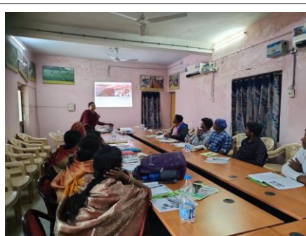
Fig 6 : Scientist (Animal Sc.) imparted training to farmers

The present study was conducted to find out the gain in body weight, egg production, and average age at first laying in the Improved variety Chicken under backyard conditions along with the impact on their socio-economics status of scheduled caste farmers. It was observed that these birds were better resistance to disease with a mortality of 3-7% and meat quality was widely accepted by the native people (Table 2). It was found that the body weight gain pattern was significantly higher than that of desi (country) type birds. The farmer also got higher net return i.e. Rs. 14,742/- than the desi breed (Rs. 4745/-).