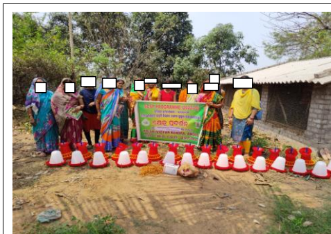
Fig 5 : Input distribution