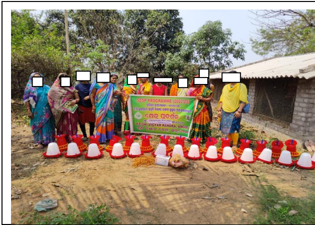
Fig 5 : Input distribution