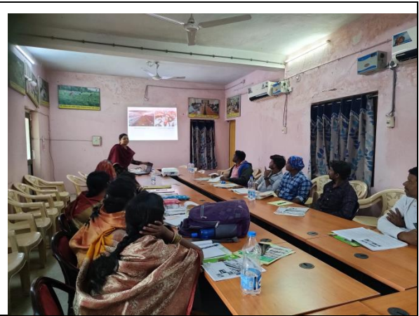
Fig 6 : Scientist (Animal Sc.) imparted training to farmers

The present study was conducted to find out the gain in body weight, egg production, and average age at first laying in the Improved variety Chicken under backyard conditions along with the impact on their socio-economics status of scheduled caste farmers. It was observed that these birds were better resistance to disease with a mortality of 3-7% and meat quality was widely accepted by the native people (Table 2). It was found that the body weight gain pattern was significantly higher than that of desi (country) type birds. The farmer also got higher net return i.e. Rs. 14,742/- than the desi breed (Rs. 4745/-).