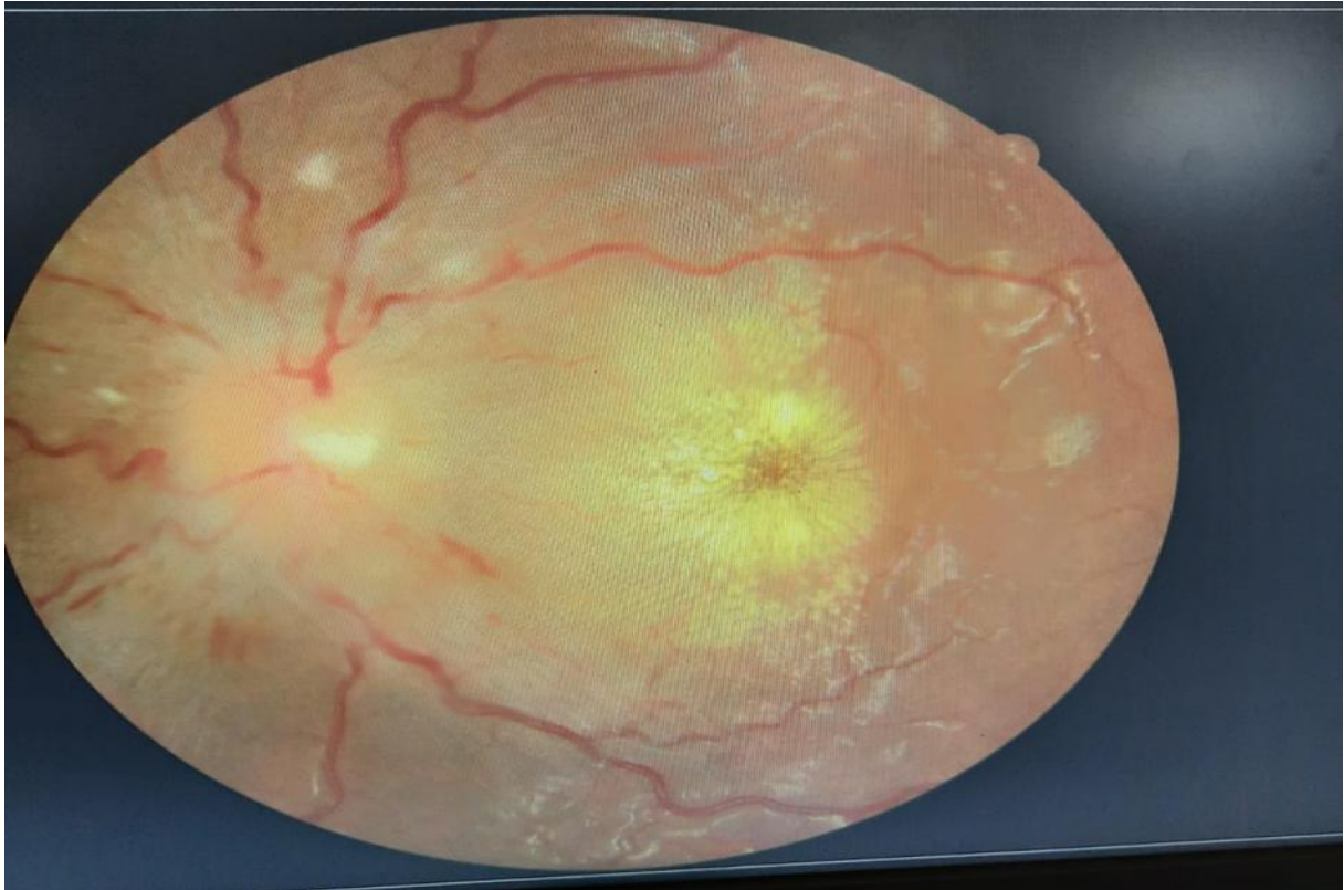
Figure 1: showed bilateral papilledema dry exudates, as well as retinal serous detachment with a stellate appearance of the macula