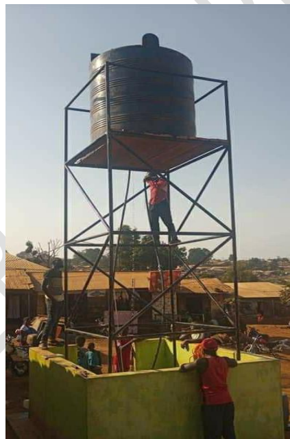
Village borehole in a market square