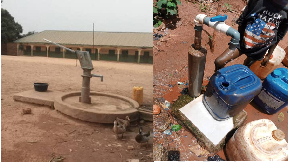
Central borehole in a community primary school Children fetching water from a borehole