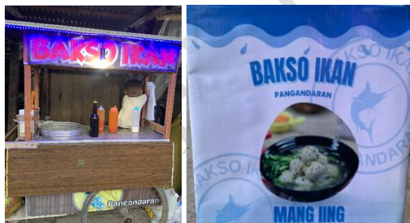
Figure 1. Place selling Mang ling fish balls

Mang ling fish balls are a processed fishery product produced by MSMEs Mang ling. The production is located in Bojongjati RT 1 RW 4 Wonoharjo Village, District Pangandaran, Pangandaran Regency. This business has been started since 2006. The products are the result is fish meatballs in sauce. This business was founded on the basis of an idea that Mang ling had with see the fisheries potential in the Pangandaran area. The initial capital used is also pure personal savings without any cooperation with other parties.