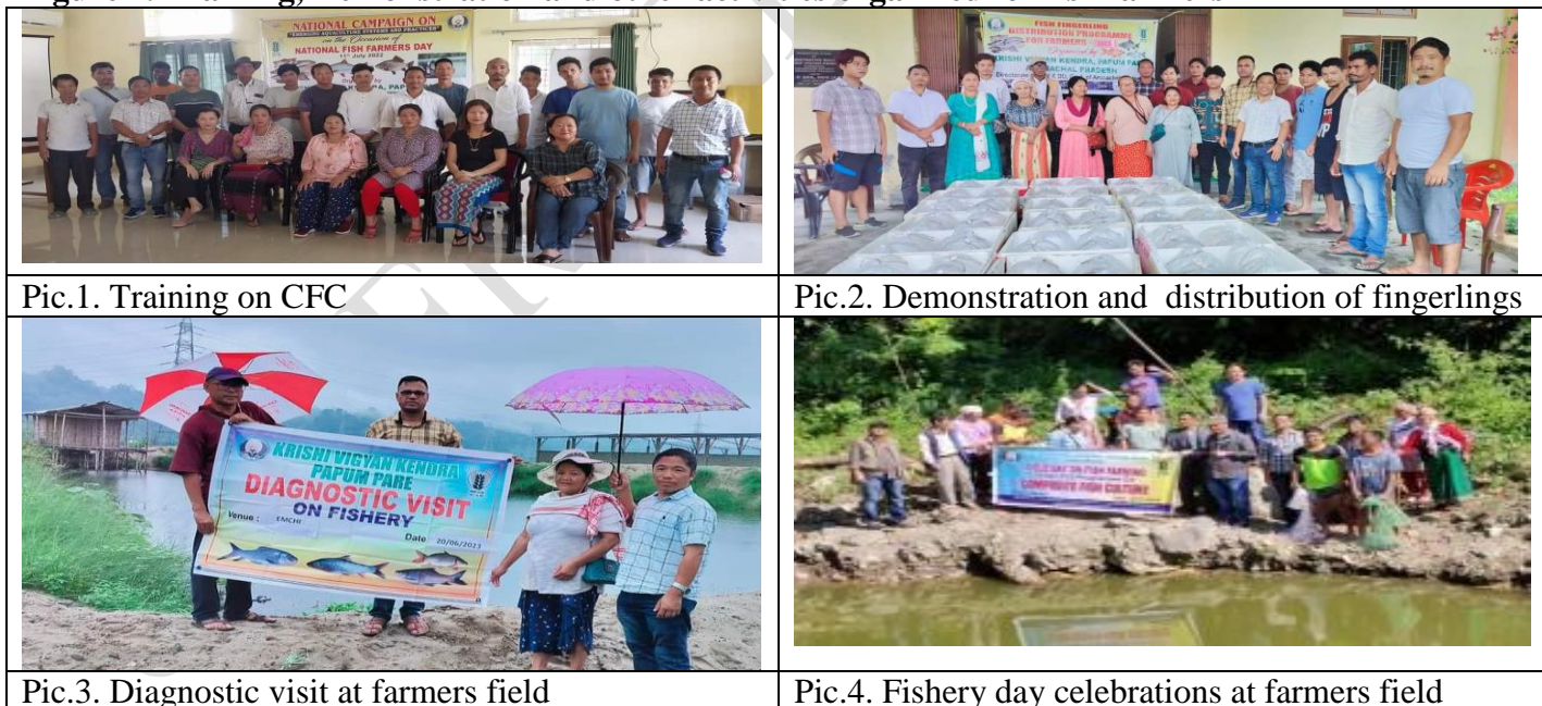
Pic.1. Training on CFC