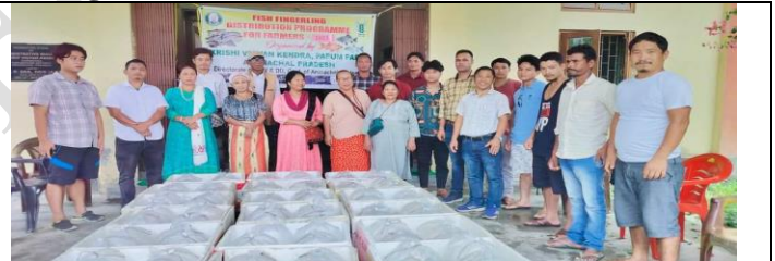
Pic.2. Demonstration and distribution of fingerlings