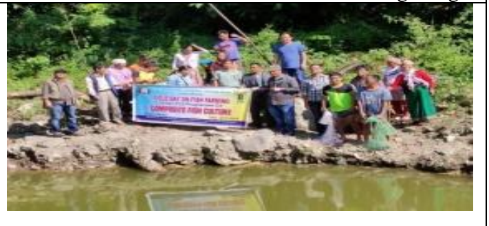
Pic.4. Fishery day celebrations at farmers field