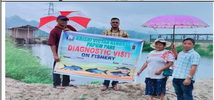
Pic.3. Diagnostic visit at farmers field