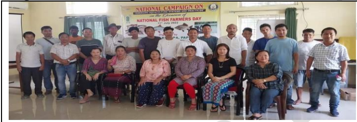
Pic.1. Training on CFC