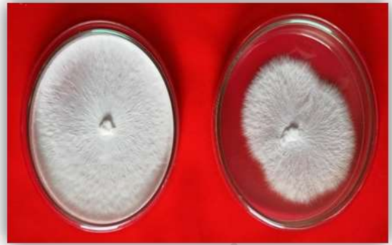
T4: Fosetyl Al 80% WP