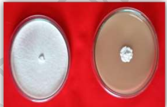
T6: Metalaxyl 8% + Mancozeb 64% WP