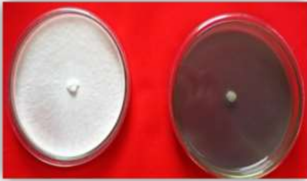
T3: Copper oxychloride 50% WP