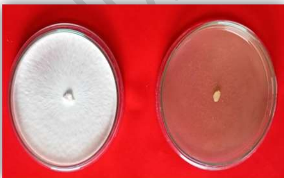
T7: Fluxapyroxad 167 G/L+ Pyraclostrobin 333 G/L SC