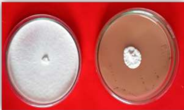
T5: Cymoxanil 8% + Mancozeb 64% WP