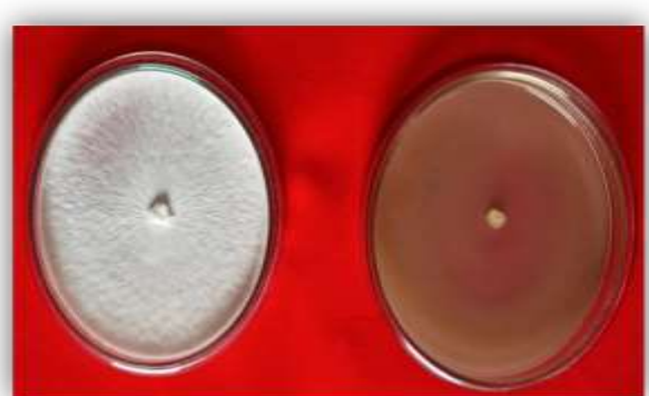
T8: Metiram 55% + Pyroclostrubin 5% WG